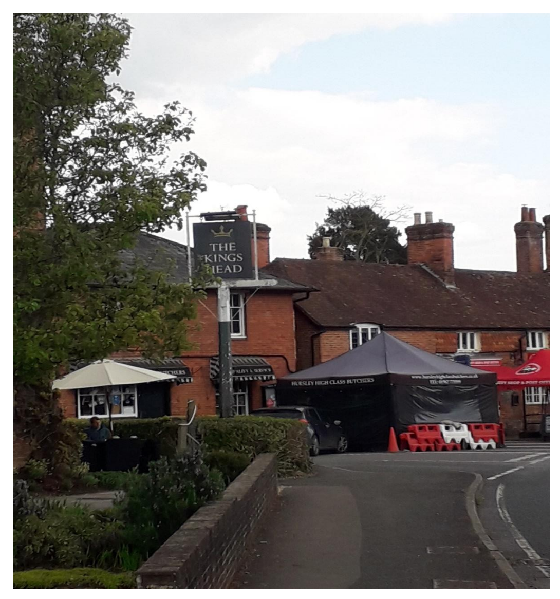
Public view from Main road, near to the Kings Head